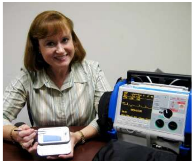
Bluetooth technology in the palm of the medics hand