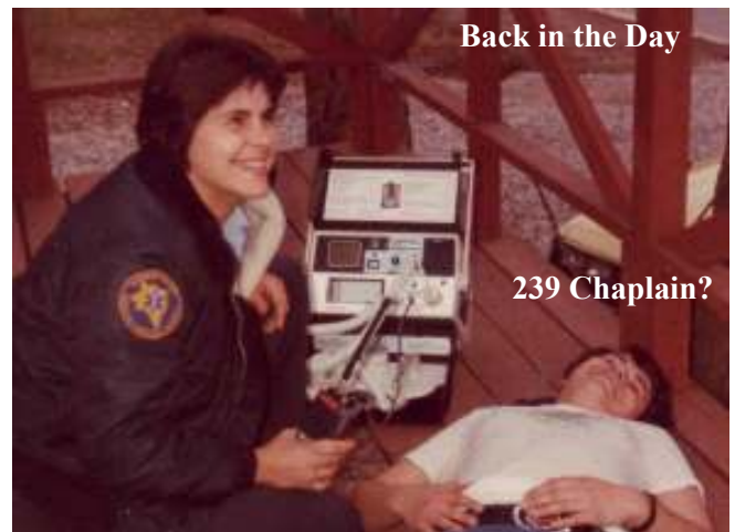
Back in the Day