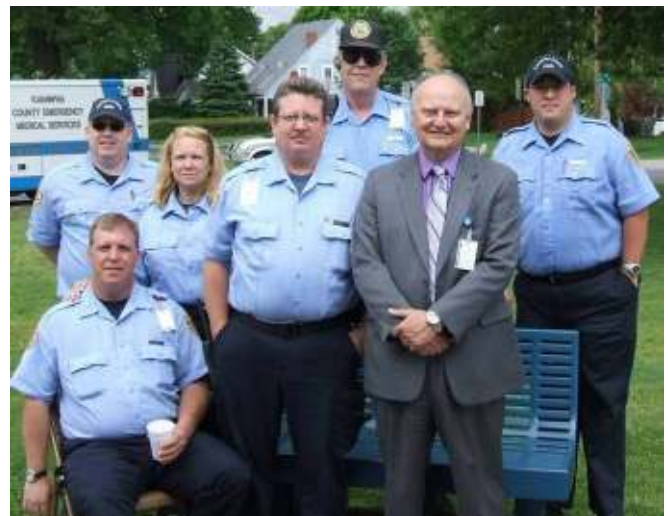
CAMC Memorial Hospital Picnic for EMS crews